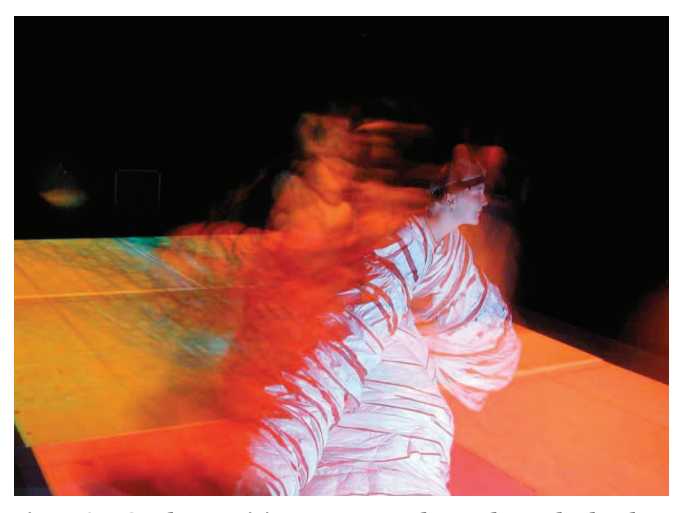
Figure 2. TGarden participant at Las Palmas, the Netherlands, wears a sensor-equipped costume that measured acceleration and orientation of movement.

Currently, FoAM is working on the Transient Reality Generators (TRG; see http://fo.am/trg) project in collaboration with Time's Up and Kibla. In TRG, we explore people's interaction with an environment modeled as an ecosystem or a universe that reshapes itself on a human scale. The space consists of self-contained but interconnected modules that are stretchable and inflatable. The modules' physical properties