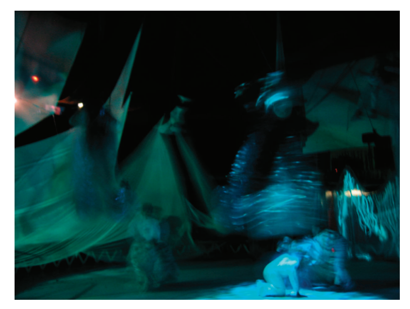
Figure 3. txOom responsive environment in Great Yarmouth's Hippodrome. The player's costumes are "wearable architecture": harnessed several meters off the ground, the costumes functioned both as sensing devices and projection screens.

(stretch, inflation, air density, and so on) can be modulated by the same dynamics that manipulate the visual and sonic media.