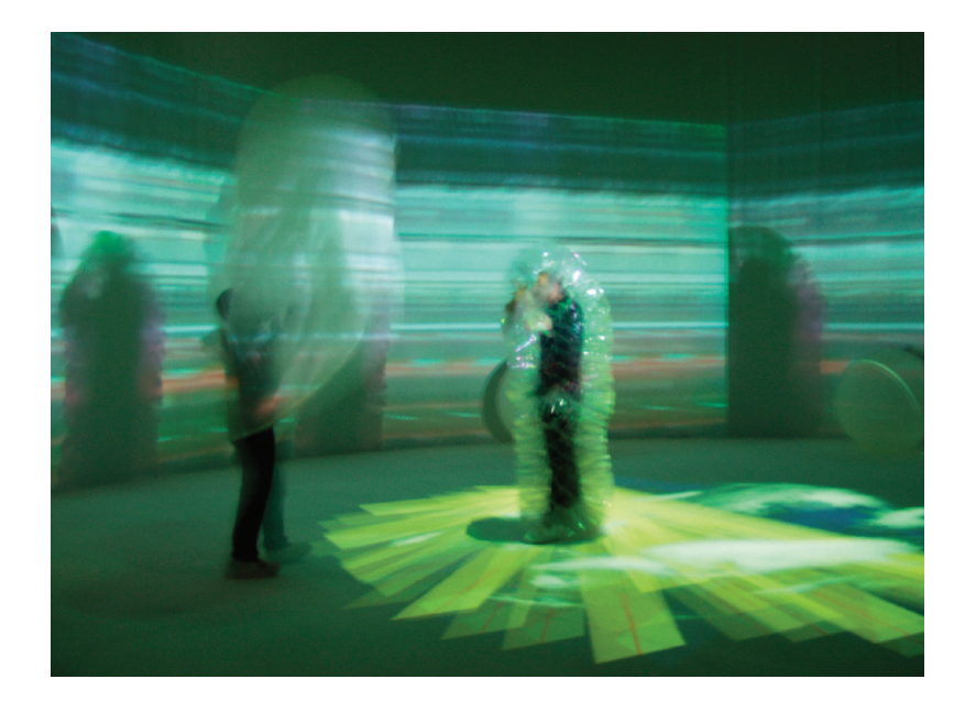
Figure 1. The txOom responsive environment at Italy's BIG Torino Festival (Biennale Internazionale di Arte Giovane).

Another group of participants enters the space, making large movements and disrupting the previously composed patterns. The first participant walks across the room. The system recognizes her movement pattern, and resumes the subtler sonic and visual coloring, mixing in the audiovisual patterns generated by the new players. The other participants might see that moving as a group affects the environment differently than playing with it individually. With the environment itself modulating its responses to these situations over time, distinguishing aspects of individual and social play.<sup>6</sup>